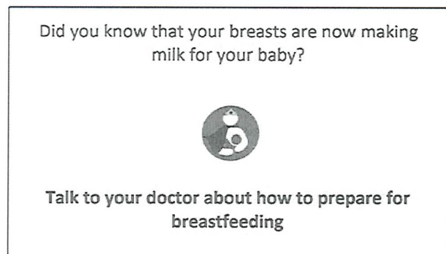
FIG. 5. “You are making milk” given to Crozer-Chester Medical Center patients after 20 weeks during an anatomy ultrasound. Created by Dr. Swathi Vanguri.

Physician interaction with the breastfeeding dyad in the immediate postpartum period depends on the system of health care and insurance systems within the country. For example, if you are in a system in which you see infants while in-hospital, you can collaborate with local hospitals and maternity care professionals within your community 50,51 and provide your office policies on breastfeeding initiation within the first hour after birth to delivery rooms and newborn units.