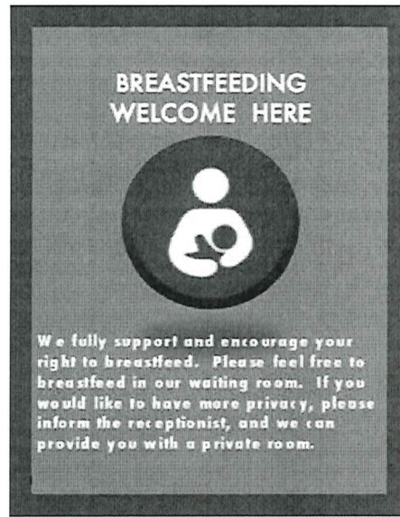
FIG. 1. (Left) Sign created for Center for Women’s Health at SilverSide of Prospect-Crozer Health System. (Right) Sign created by Virginia Department of Health. Created by Dr. Swathi Vanguri.