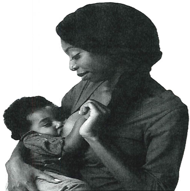
FIG. 2. An example of racially and ethnically diverse images depicting breastfeeding in a positive light.

The following are examples of racially and ethnically diverse images depicting breastfeeding in a positive light (Figs. 2–4).