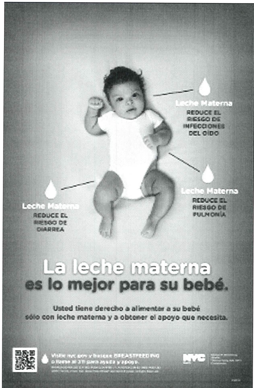
FIG. 4. New York City department of health poster, 2012.

while breastfeeding, and the effects on the infant. 48,49 Anecdotal evidence shows that mothers will discontinue breastfeeding while on antibiotics, antidepressants, or antiepileptics either as a result of direct instruction or assumption about the risk to their infant. They should be educated early that many common medicines are safe to use while breastfeeding, and at the very least enlightened about available resources to verify which medicines are compatible with breastfeeding.