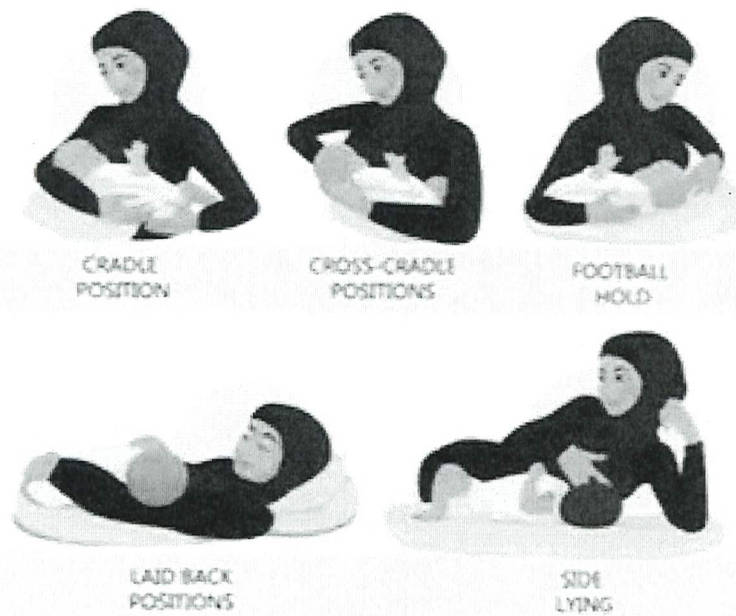
FIG. 3. Breastfeeding positions.