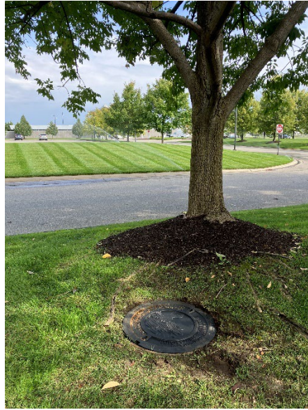
WAT067002 59 & Airport Wilmont Relief