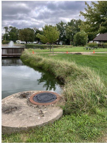
WBT002018 2025 Beechmont Beechmont