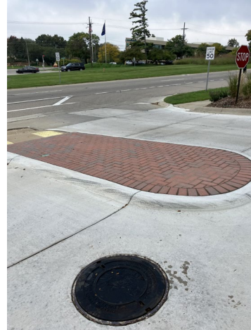
FAT003007 13 Mile & Northwestern Hwy Coy