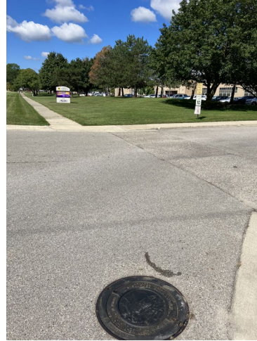
FAT011002 32900 13 Mile Rd Minnow Pond