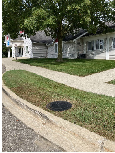
OAT076228 3100 W Gunn Rd Alpine Academy