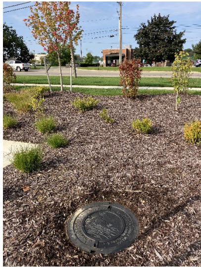
LYT115008 22700 Pontiac Trail Sayre