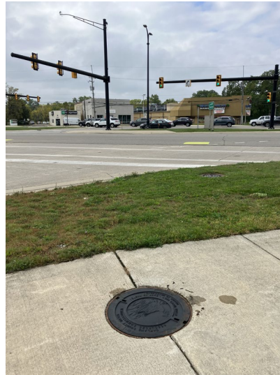
FAT006025 14 Mile & Northwestern Hwy Pebble Creek