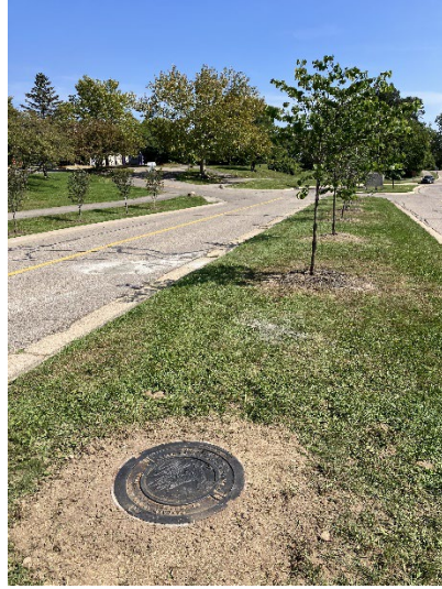
WAT051012 Waterford Oaks Park Dr Pontiac Creek Extension