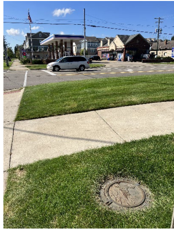
TRT016002 Square Lake & Livernois King