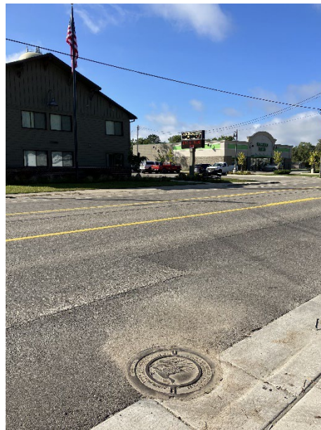
HOT129003 421 N Saginaw St Patterson Holly