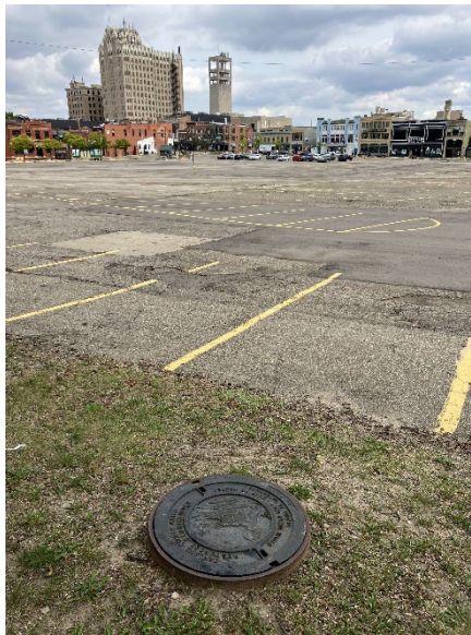
POT116004 Woodward N of Auburn Rd Pontiac Clinton River No #1