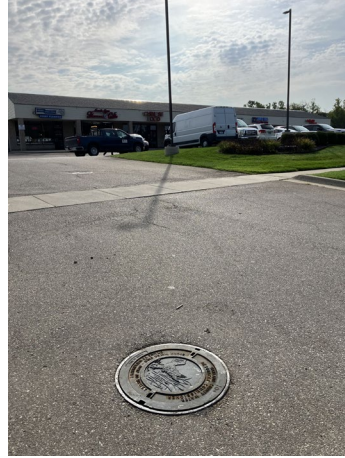
LYT079003 E Lafayette & S Maple S Lyon No 1