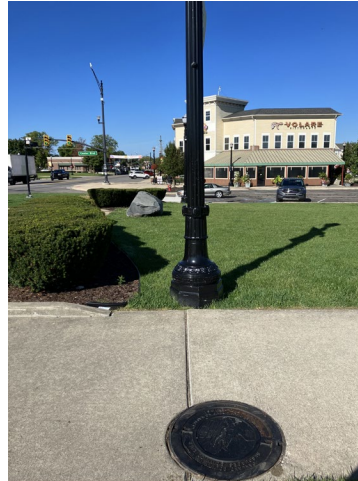
COT127095 48900 Pontiac Trail Tribute