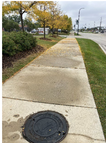
WBT138031 6560 Orchard Lake Rd Edwards Relief