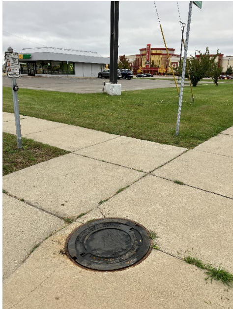
TRT134012 N Main St & E Maple Rd Halfpenny