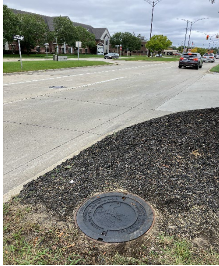
TRT043010 E Long Lake & Rochester Rd Houghten