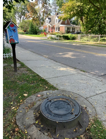
PLT009002 Hutton St Randolph