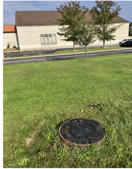
AVT134050 525 Auburn Rd Wolf