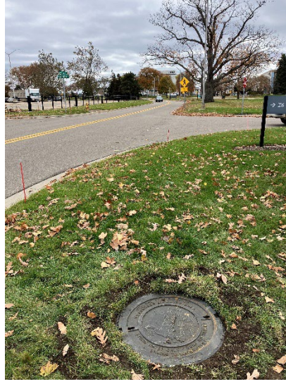
WAT093001 Powerhouse & County Center Mainland