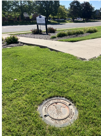
AVT103028 Barclay Circle & Hampton Circle Hampton