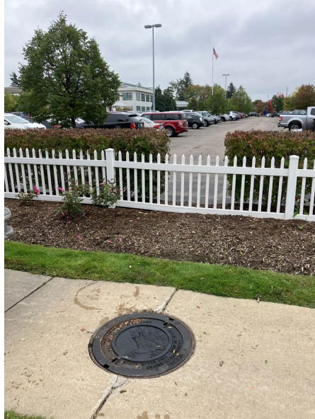
FAT144144 20810 Botsford Dr Clarenceville