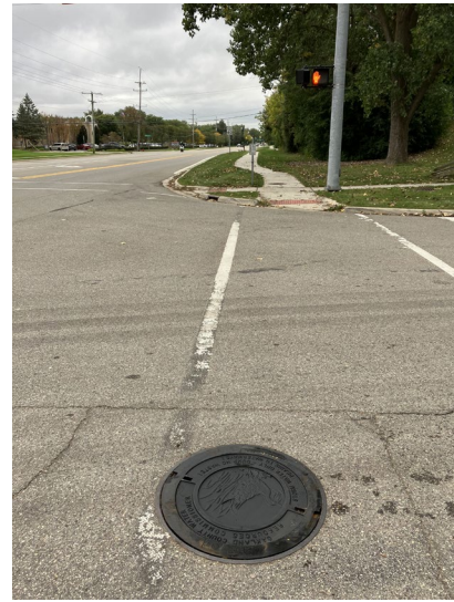
BLT132046 Lahser & Lincoln Luz