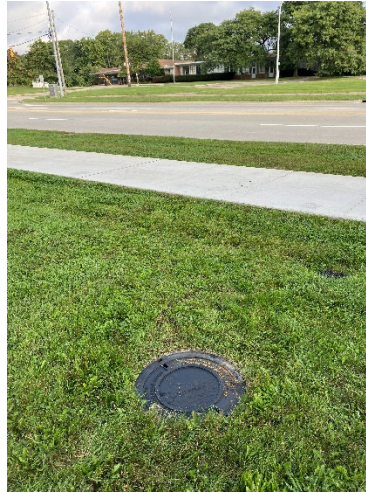
SOT054032 12 Mile & Harry R Pogarts Rummell Relief