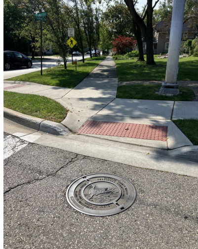
FAT109001 Farmington & Shiawassee US-16