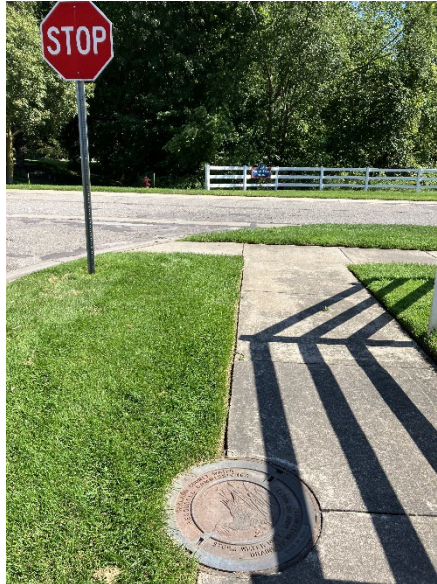
OAT117143 South of 4324 Bold Meadows Crossings