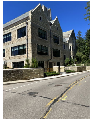
BLT091009 Cranbrook S of Lone Pine Bloomfield Hills CSO