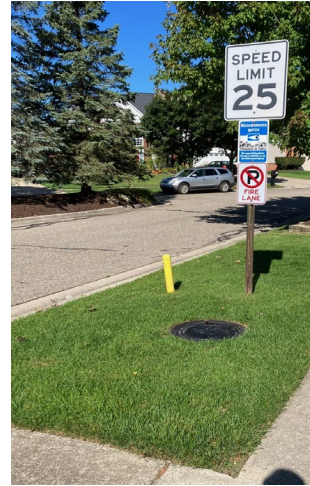
COT126012 Pheasant Run West & W Maple Sibley