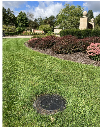
HIT053001 2462 Vero Dr White & Duck Lake