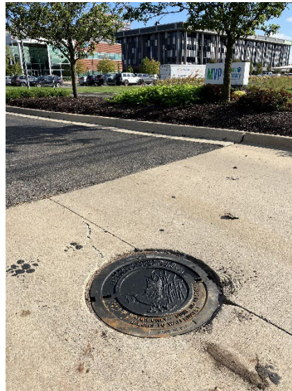
SOT085001 20500 Civic Center Rummell Relief