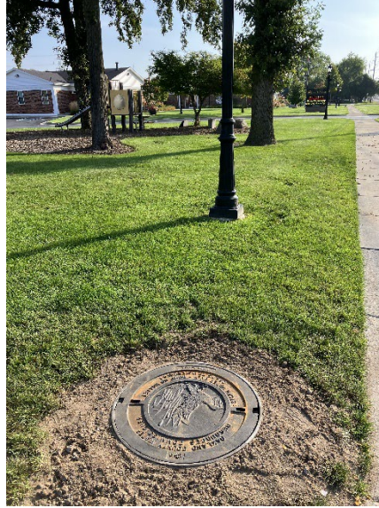
COT138020 1499 E W Maple Greenway