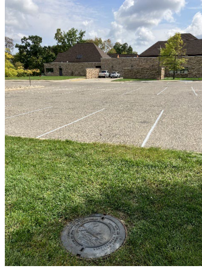
OAT119248 3739 Kern Rd Eagle Creek