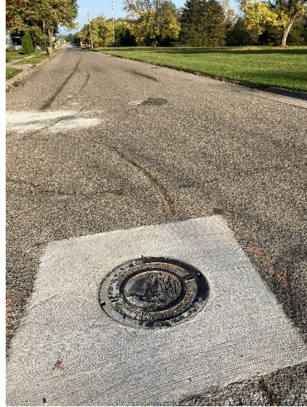
POT114020 Florence & Norton Augusta