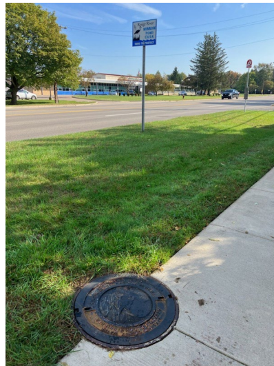
FAT058004 32823 W 12 Mile Rd Minnow Pond