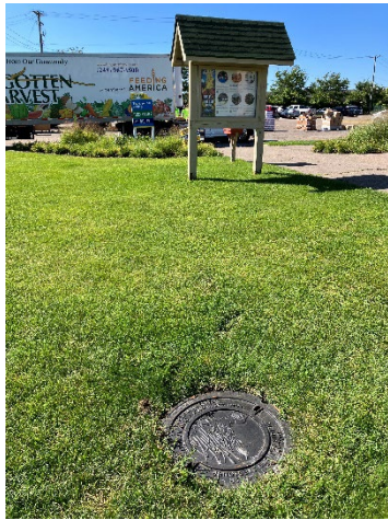
ROT044007 29601 John R Rd GWK