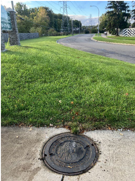
POT058012 Walton Blvd & Gambrell St Holland