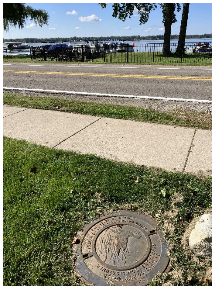
COT139004 E Walled Lake & Arvida St Leon