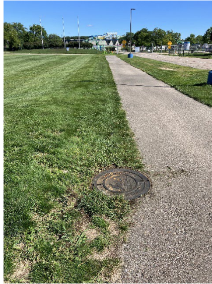
ROT004037 1455 E 13 Mile Rd GWK