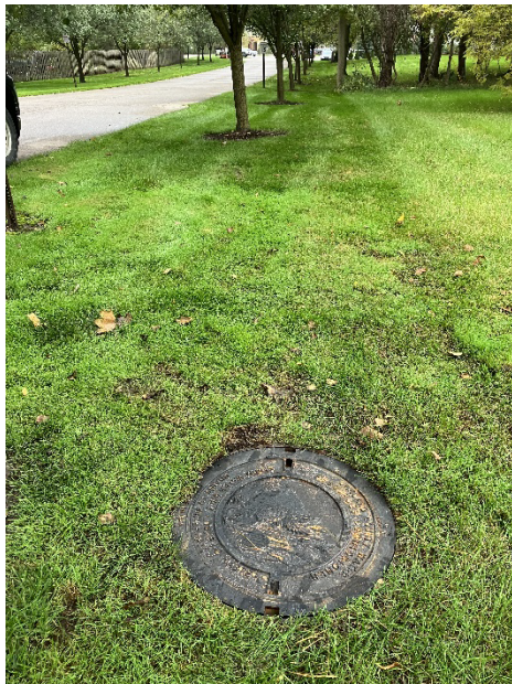
ORT003016 50 N Perry St Axford