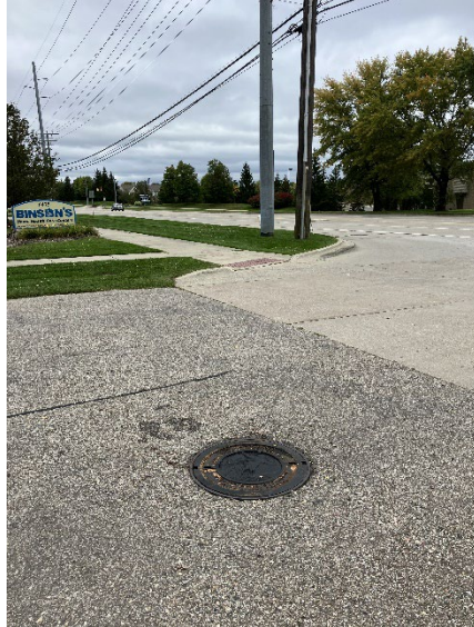
TRT009054 6445 Marengo Elliott