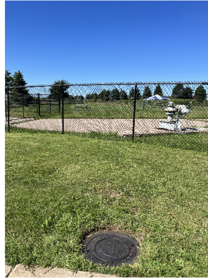
ROT004024 31353 Dequindre Rd GWK