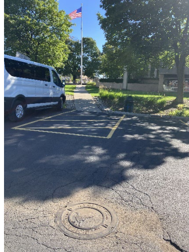
POT116034 60 E Pike St / Pontiac Public Library Pontiac Clinton River No #1