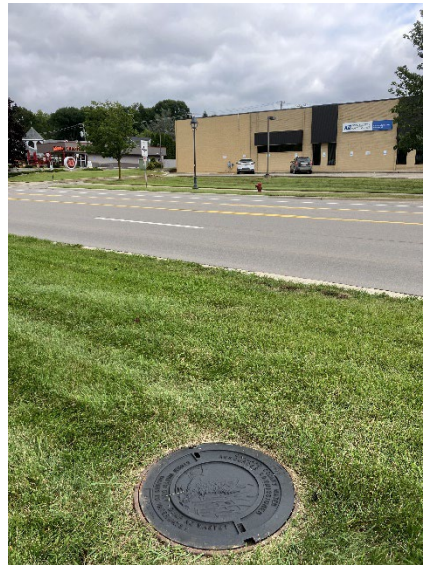
INT115029 5805 S Main St M-15