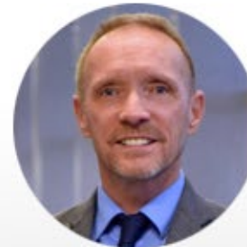
DAVID COULTER OAKLAND COUNTY EXECUTIVE

The Oakland County Health Division will not deny participation in its programs based on race, sex, religion, national origin, age or disability. State and federal eligibility requirements apply for certain programs.