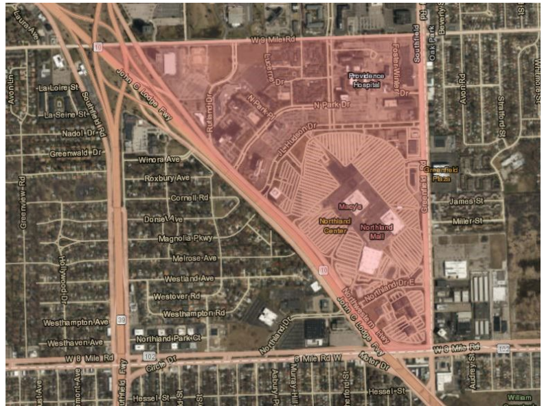
NORTHLAND REDEVELOPMENT PLAN

Contact (248) 796-4161 CityOfSouthfield.com