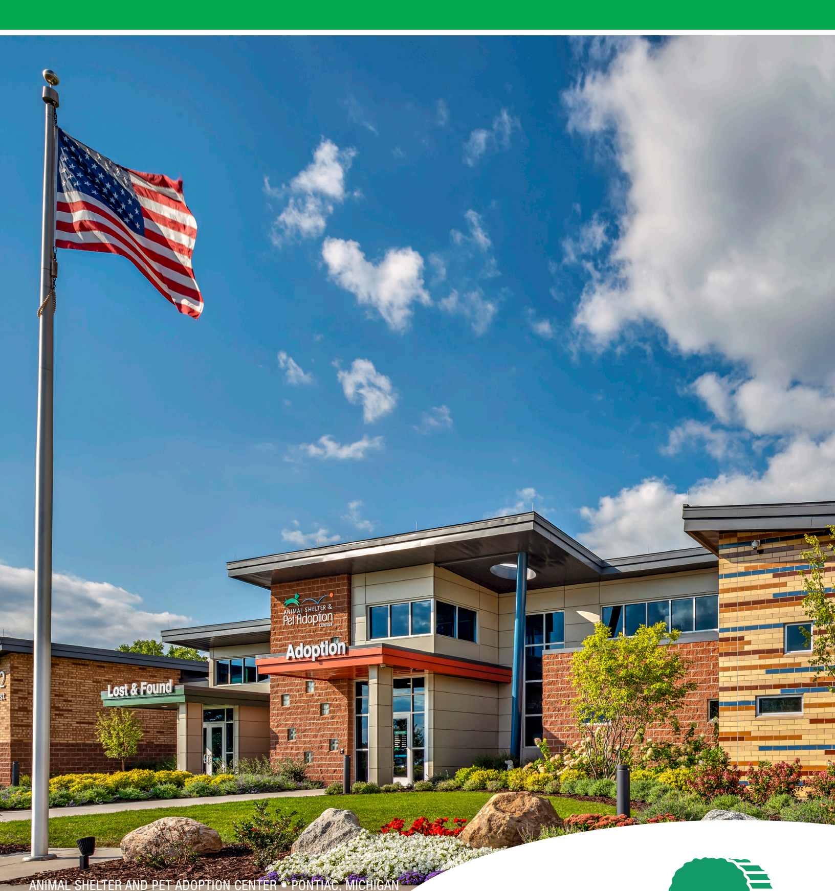
ANIMAL SHELTER AND PET ADOPTION CENTER • PONTIAC, MICHIGAN